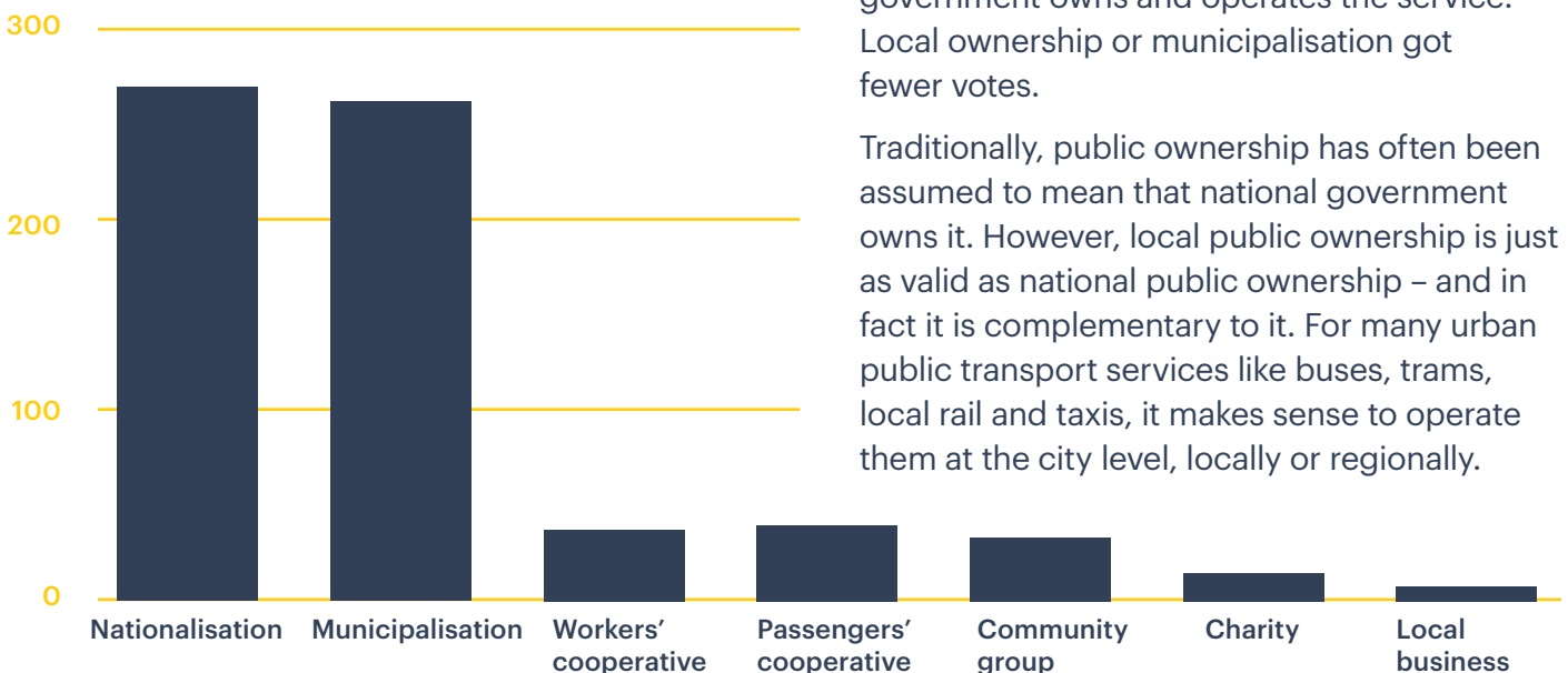
Figure 2: What models of ownership fit your definition of public ownership?

Public ownership means people come first. Profits must be reinvested for the benefit of the public. This might mean direct reinvestment into the service or returning money to the public purse, at the appropriate level (local, regional or national). There should not be any shareholder dividends. We do not believe in public transport that makes a private profit.